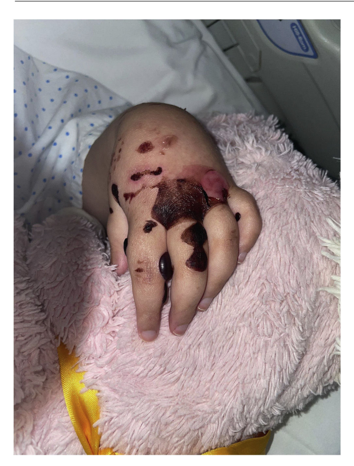
Figure 2 Progression to blisters filled with blood-stained fluid.