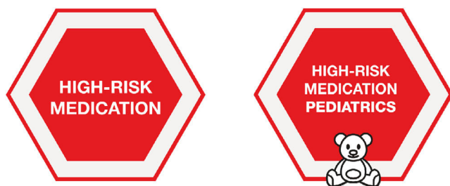
Fig. 2 Recommended symbols to identify high-risk medications.

and to evaluate the effectiveness of established safety practices. Evaluations should be conducted at regular intervals to measure and analyze outcomes with the Risk Management Committee, the Pharmacy and Therapeutics Committee, and the center's management team.