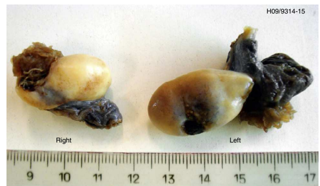
Figure 2 Gross examination of surgical specimens.

\beta -HCG is a glycoprotein hormone, which, as well as being associated with pregnancy, is considered a tumour marker