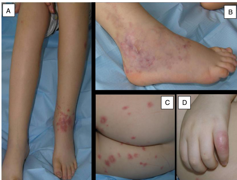
Figure 1 Skin lesions in case 1. (A) Painful swelling in left ankle with purpuric lesions in the anterior surface. (B) Livedo reticularis with haemorrhagic suffusion in the external lateral surface of the right ankle. (C) Isolated purpuric lesions in the buttocks. (D) Skin nodule in the fifth finger of the right hand.

of various autoimmune diseases, their efficacy in the treatment of vasculitis has not been demonstrated. 4 The largest case series in the paediatric age group corresponds to a study by Eleftheriou et al. 5 that comprised 25 patients with vasculitis (11 with PAN). Of the PAN patients, 8 received infliximab, and their mean vasculitis activity score decreased from 8 to 3. The PVAS 6 scale has been recently validated for the routine assessment of disease outcome and response to treatment.