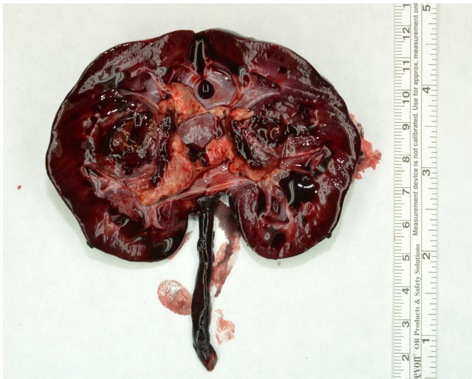
Figure 1 Macroscopic description: nephrectomy specimen cut at the hilum with a 2 × 2 cm mass located in the renal pelvis, with areas with a necrotic appearance.

Ninety percent of renal tumours in children are nephroblastomas. These tumours are usually found in the renal parenchyma. Nephrogenic rests (nodular collections of embryonal cells that persist beyond 36 weeks' gestation) are considered precursors of nephroblastoma, as they are