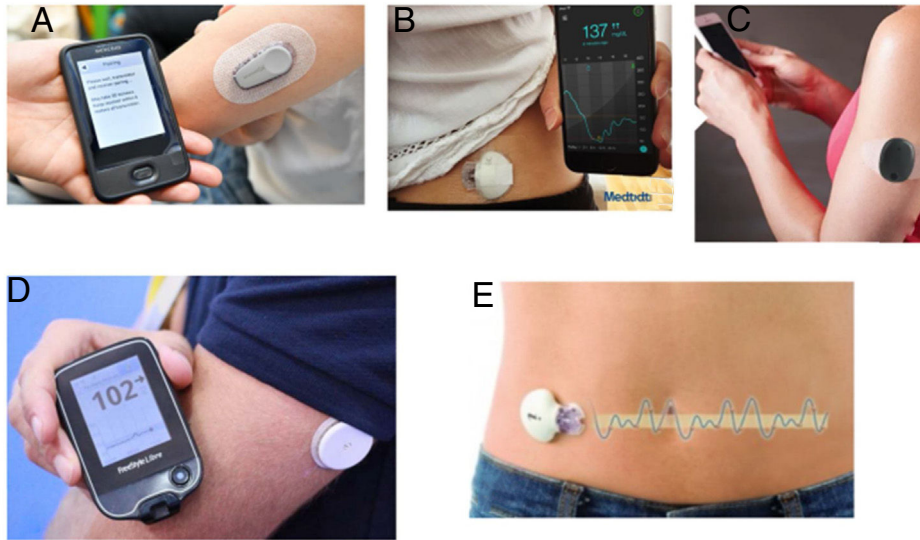
Fig. 1 Types of continuous and on-demand glucose monitoring: Dexcom system, Novalab (A); Guardian system, Medtronic (B); Eversense system, Roche (C); FreeStyle system, Abbott (D); iPro blinded monitoring system, Medtronic (E).

Flash glucose monitoring systems, in which data are only shown when the sensor is scanned, and CGM systems provide information of glucose levels at 5-minute intervals and on glucose level trends. These systems have improved considerably in recent years, in both accuracy and precision, and some are factory-calibrated. At present, the data provided by these systems is precise enough to be used instead of capillary glucose measurements to guide clinical decision-making save in special circumstances. Another important advantage offered by technology is that devices are equipped with alarms and alerts to signal the risk of hyperglycaemia or hypoglycaemia, remind the patient of undelivered boluses or warn of pump blockages (Fig. 1).